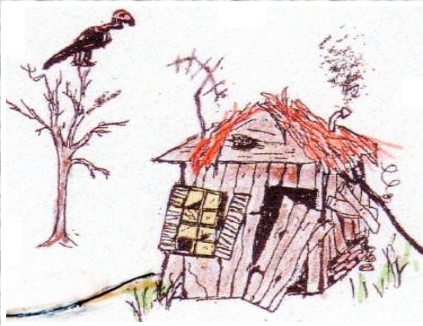
The Cosmic Compound